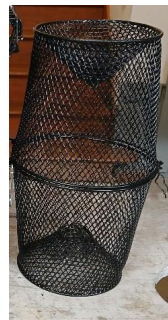
Mini Spat Tube, 17" long

The scouts will build "Eagle Scout Grow-out Kits." This kit consists of a mini spat tube and a Tidal Tumbler (or a Rough Rider: better for high-energy water).